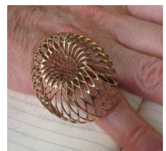
Demonstration piece: Orbis ring